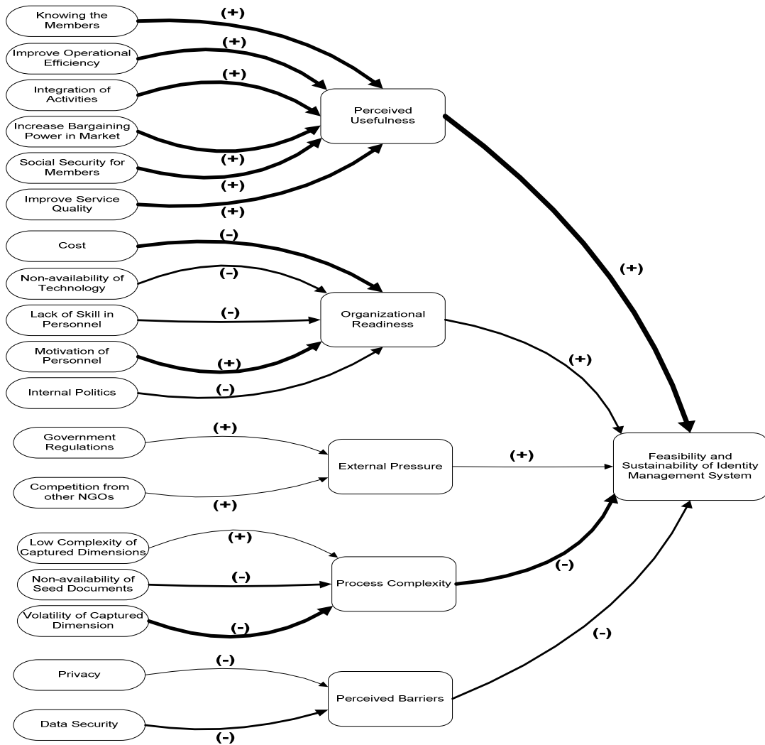
Figure 2: Effect and Strength of Identified Dimensions

The model explained in Figure 2 demonstrated the effects of perceived usefulness, organizational readiness, external pressure, process complexity and perceived barriers on the feasibility and sustainability of identity management system. During the study it was also found that the dimensions and its effects on the factors of the model vary from organization to organization. Hence, for a system that is to be used in a multi-organization environment, all the factors and their related dimensions need to be examined from the perspective of each organization involved in the exercise. In the case of a nation intending to implement such a system needs to analyze these factors from the perspective of its different departments.