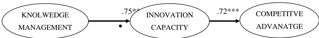
Figure 2: Final model with significant pathways of focal variables. ***p<.001