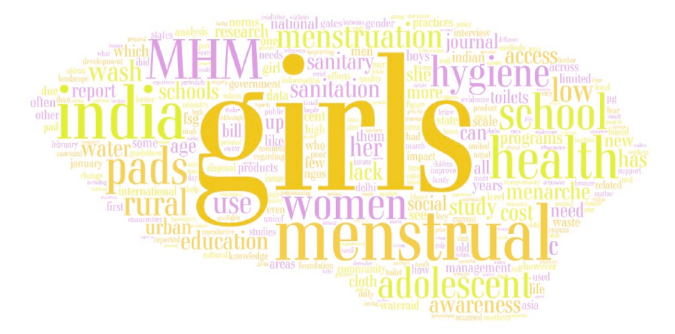
Fig. 2. Wordcloud representing a semantic analysis of 57 online sources addressing menstrual hygiene management in India.

Since she had been living in the slum for the last fifteen years, we questioned her about the views of the younger generation of women in the slums towards the use of sanitary napkins and whether they would