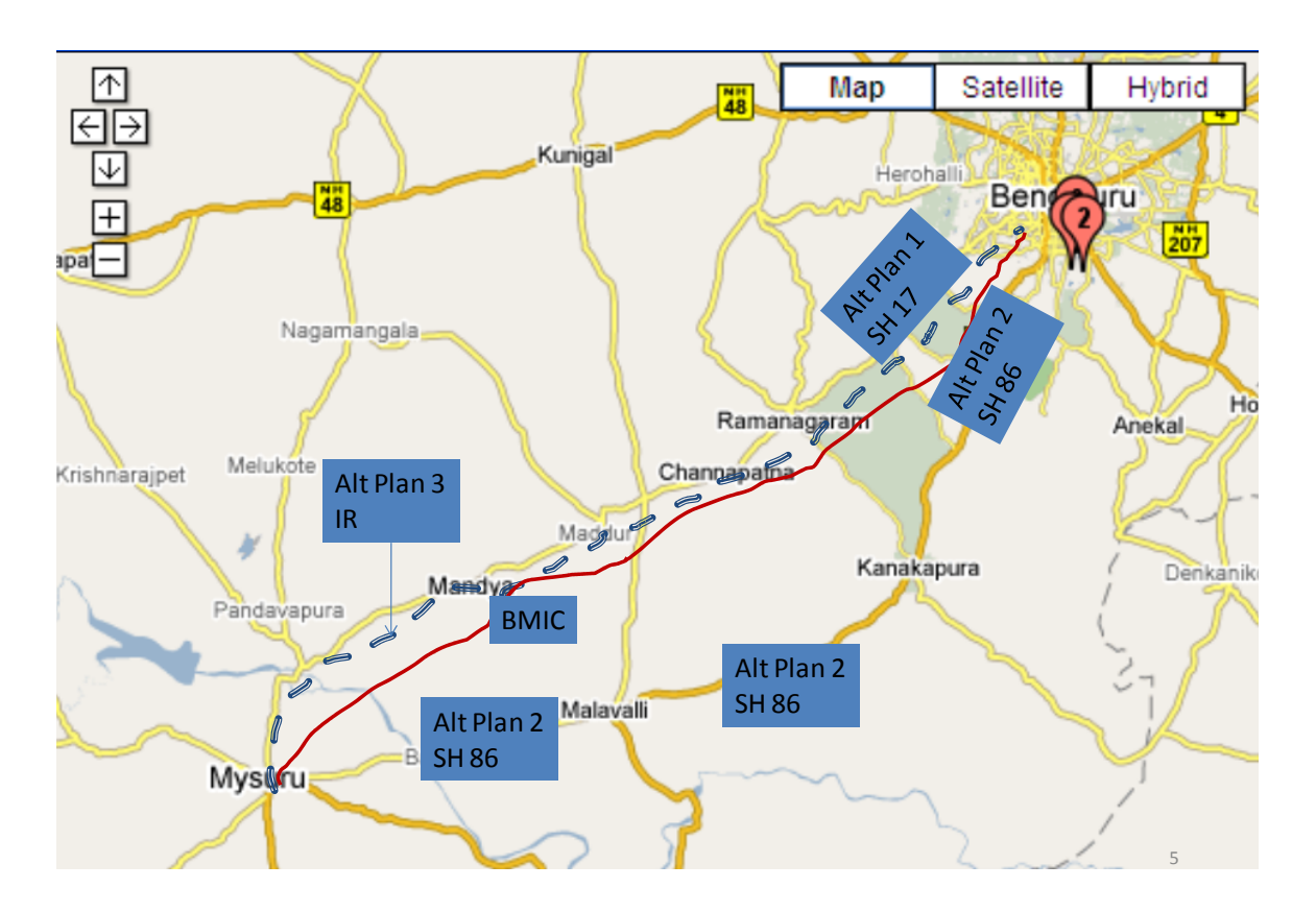
Exhibit 1: Project Alternatives