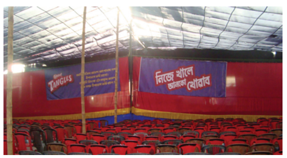
Exhibit 9b: Photos of Screen Banners