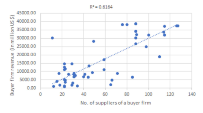
Fig. 1. Relationship between the number of suppliers and revenue of award-giving firms.

All models have included month dummies to account for seasonality.